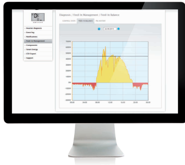
Feed-in management - feed balance: The times when there was a grid feed and when electricity was purchased from the grid can be seen at a glance in this graph. Negative (red) values indicate that electricity was purchased from the grid and positive (yellow) values that there was grid feed.

When used with the Solar-Log WEB Enerest™ XL and either the SCB, the Solar-Log 1900 monitors every single string, ensuring the most complete and secure monitoring for large-scale PV plants with exact error identification and localization.